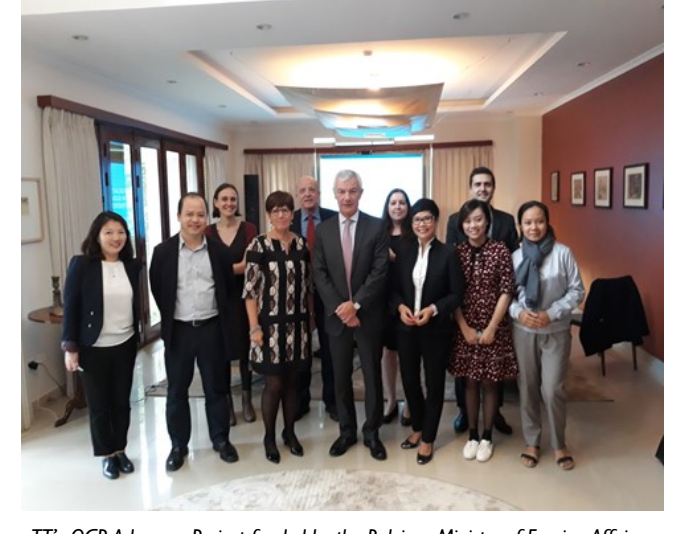
TT's OGP Advocacy Project funded by the Belgium Ministry of Foreign Affairs launched on 24 November 2017

In summary, OGP is in line with Vietnam's current legal and policy framework. It helps the country strengthen the implementation of the existing laws and policies. This also implies that OGP is neither an institution threatening to the political system nor a burden for the State. In addition, OGP is not an international treaty, but an international institution (or a platform), where the governing rules are simpler and